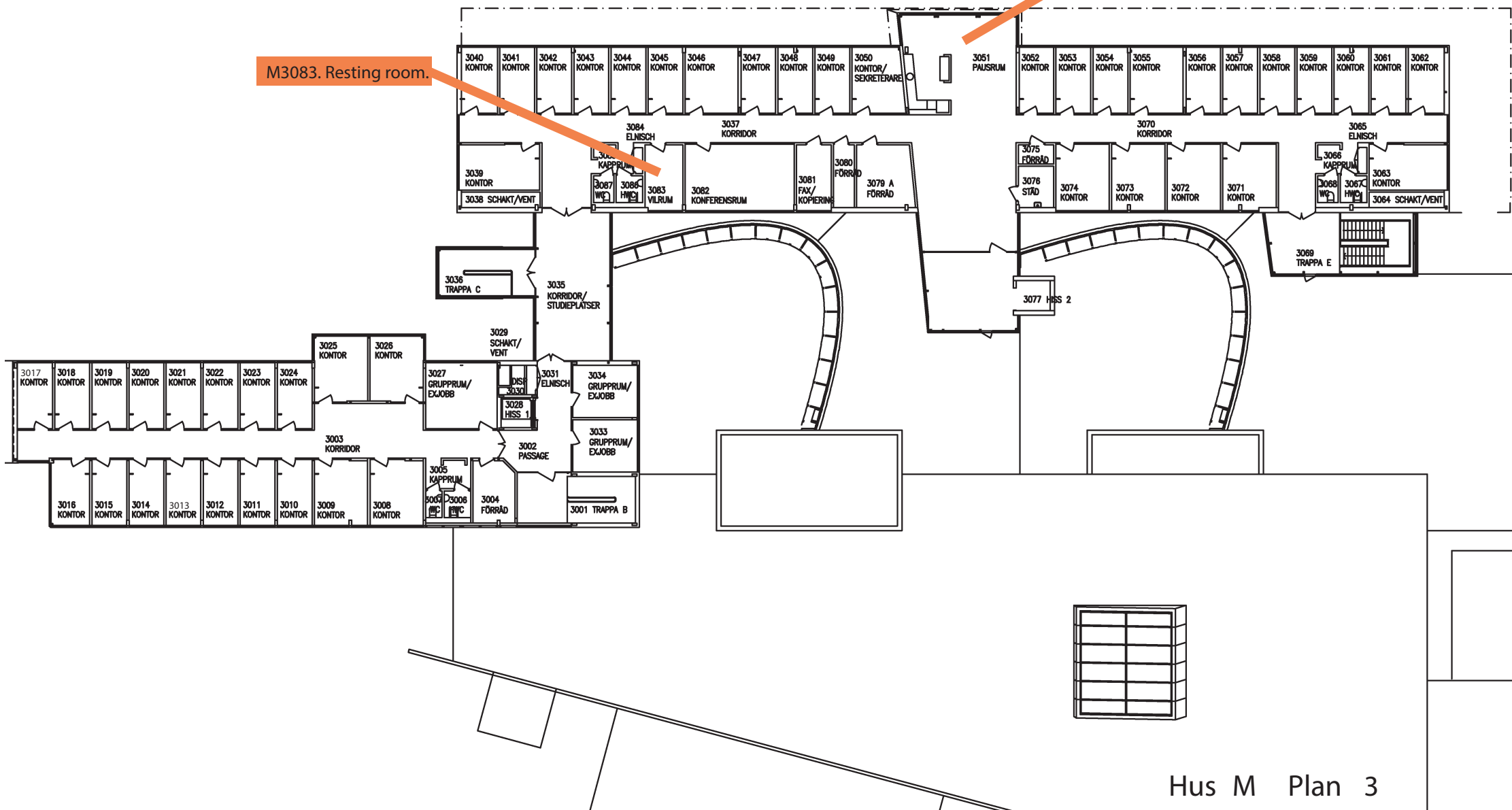
Hus M Plan 3